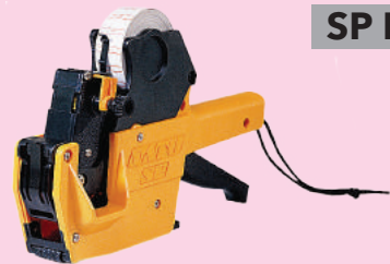
SP MARK II